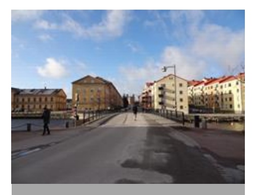
Working for our World Heritage & Future <u>www.dunc-heritage.eu</u>